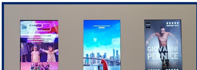
Internal advert screens