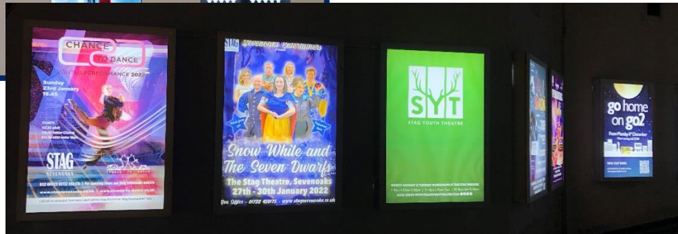
Exterior illuminated poster bays