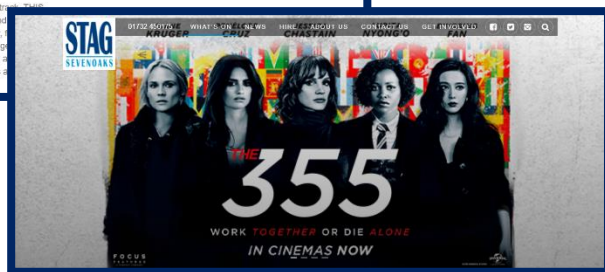
Stag web banner