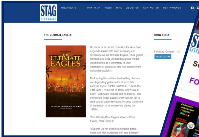
Stag web listing